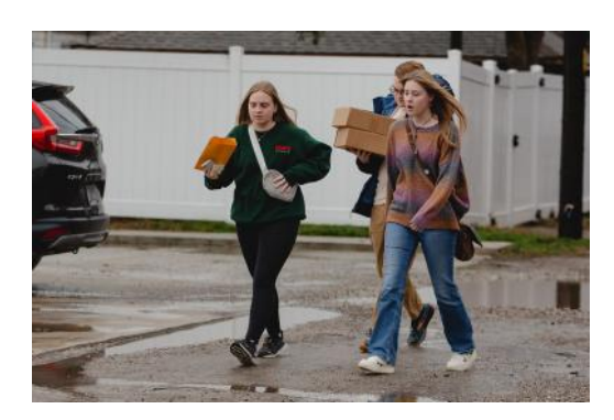
Students handed out Boxes of Love (foodstuffs) as part of one day of outreach.

Many students are being obedient to Jesus by volunteering to go on a mission trip. Over spring break, Cru is partnering with Filter of Hope to help students take that next step of faith, As you may remember, we went to the Dominican Republic last summer with Filter of Hope, and so we're excited for these trips! Cru cam-