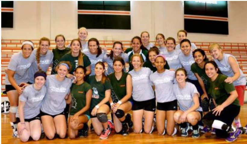
Volleyball Teams Working Together in Puebla