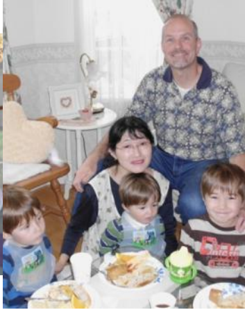
So great to visit with good friends who share our heart for the Japanese.

prayer. We have heard good news since our return that progress is being made in restoring fellowship among the staff members.