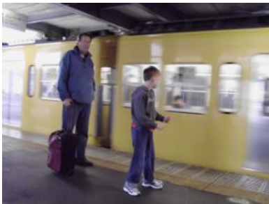
Fast trains and pounded rice balls on a stick, grilled in soy or wrapped in seaweed.

prayer. We have heard good news since our return that progress is being made in restoring fellowship among the staff members.