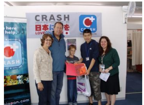
Delivering Relief Goods to CRASH

We were very happy to assist a class of 4th graders in Orlando who wanted to donate to the relief effort. We delivered socks and cards the children made to the CRASH Japan HQ and heard about the many teams going up to help people in the tsunami affected area.