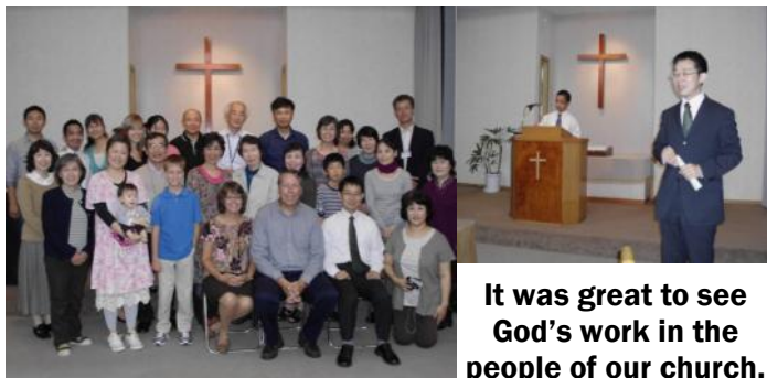
It was great to see God's work in the people of our church, and meet their new pastor.