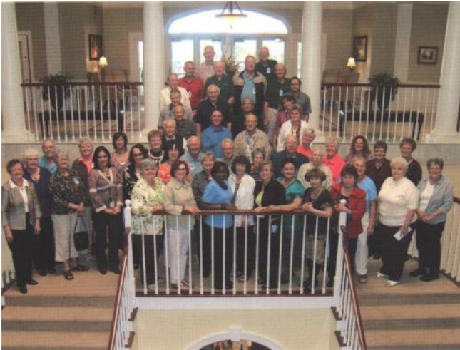
Our volunteer crew this spring at Headquarters.