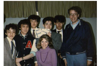
Meeting ESS clubs