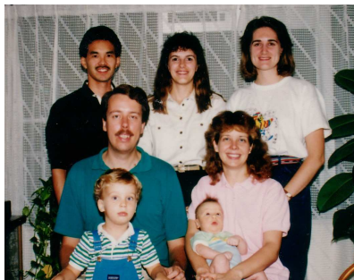
Nagoya Campus Team

NAGOYA CITY: CAMPUS TEAM LEADER 1990-1995