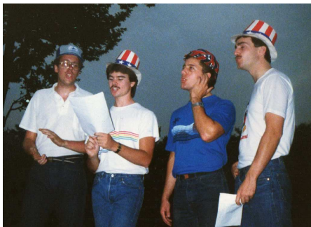
The Barbershop Quartet

For 25 years God has given us a passionate vision for reaching people with the gospel. We have given most of our lives so that Japanese may hear and believe in Jesus. Many have never heard of His power to change their lives because they are isolated by culture and language from those who would love to tell them the good news. We have been privileged to serve in many roles so that Japanese may believe in Christ and then take the lead in building spiritual movements in Japan.