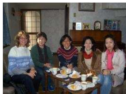
English Bible Studies

JESUS FILM AND MASS MEDIA COORDINATOR 1996-2007