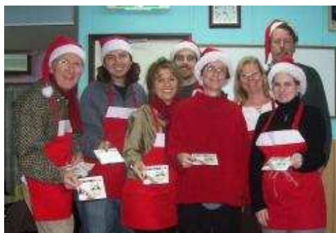
Christmas CD distribution