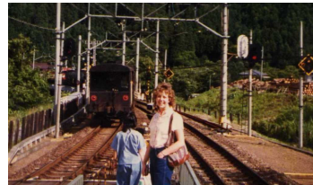
Traveling by train everywhere