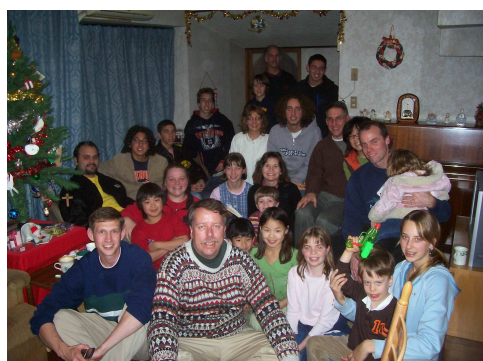
Staff Families at our After Christmas Dinner Party