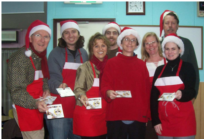
The Christmas CD distribution team from Jesus Film Project

It's a brand new year, and God is going to do many new things with our family and yours! We really appreciate your partnering with us to help bring the love of Jesus to the Japanese!