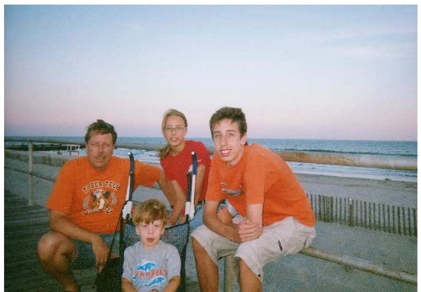
Down on the boardwalk in New Jersey—getting in some family fun!