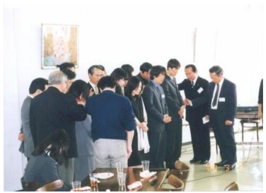
Local pastors praying for the graduates.