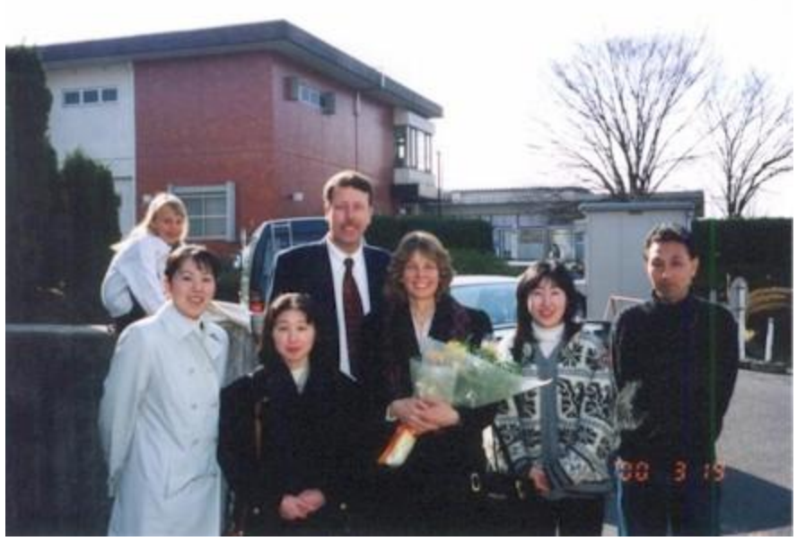
It brought back many memories of working with these friends.