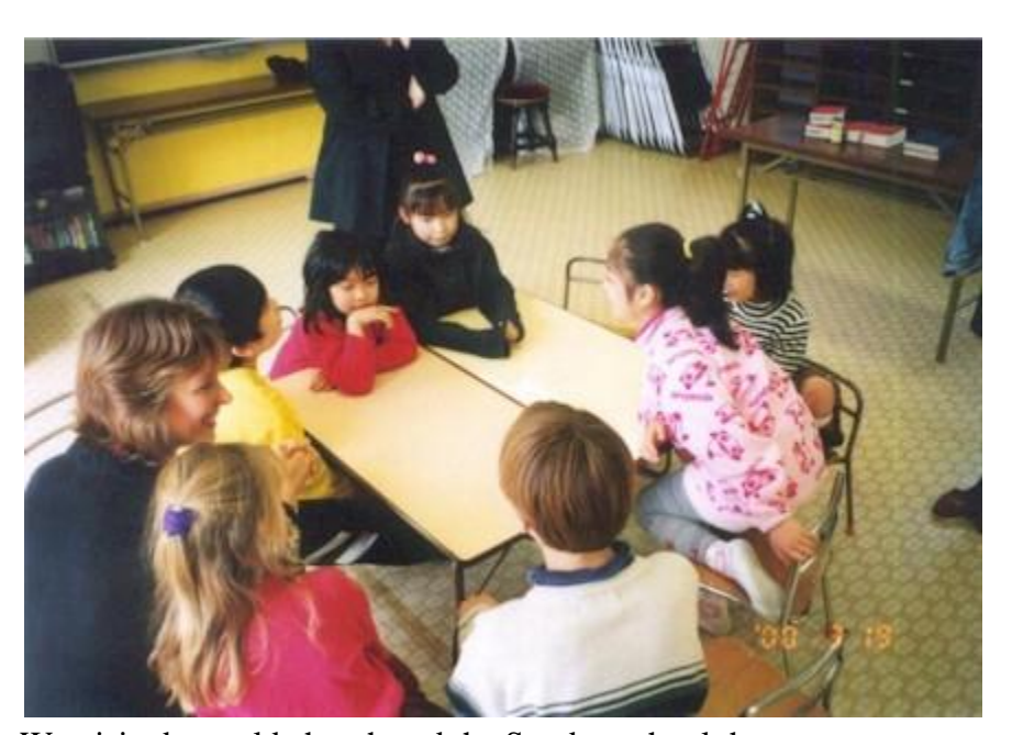
We visited our old church and the Sunday school there.