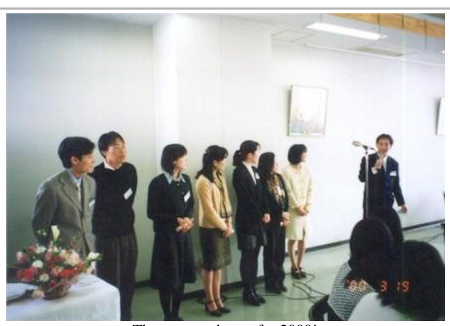
The new graduates for 2000!