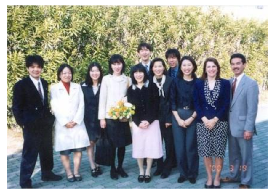
The Nagoya CCC staff and graduates involved with CCC.