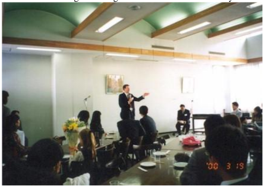
Some of those gathered for the event.