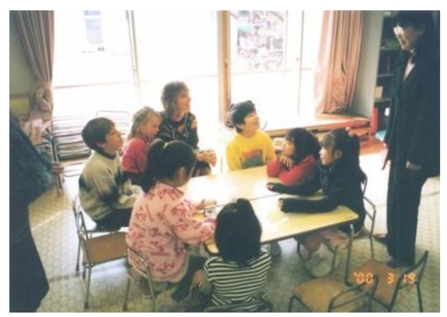
Sunday school teacher and kids.