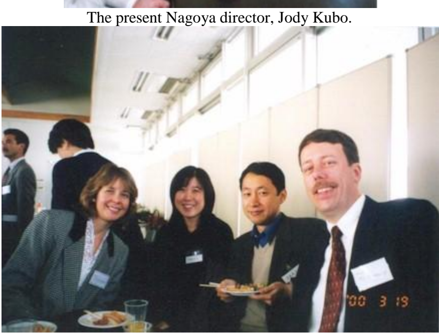
Visiting with old friends was really fun.